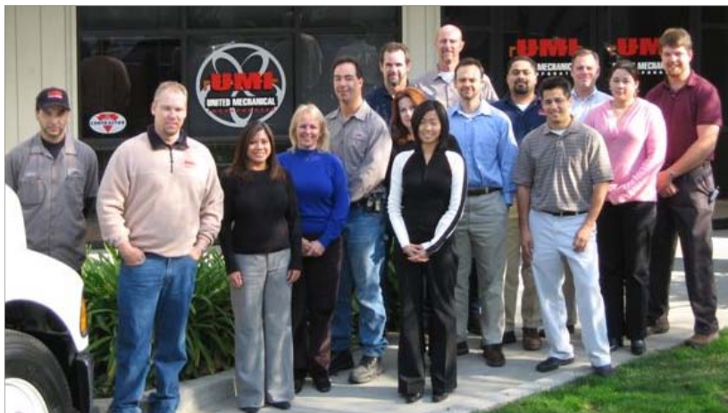
United Mechanical, Inc. Staff

Throughout Northern California, commercial clients turn to UMI for their HVAC needs. From piping and ductwork to air and water balance, UMI engineers are trained to deliver solutions that are energy efficient and environmentally friendly.