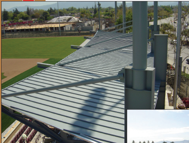
Santa Clara University Baseball Field

UMI is thrilled to be recognized as one of the Business Journal's 2006 Fast 50 Companies. It is an honor we share with our colleagues, clients and families, for it is their support and encouragement that inspires us to achieve excellence every day.