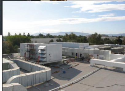
Qualcomm San Jose Fab

A t UMI we believe superior personal service is just as important as technical superiority. With an average of 20 years of HVAC experience, our skilled craftsmen bring innovative thinking and industry know-how to every project. In fact, you won't find more exacting standards or higher quality, all delivered